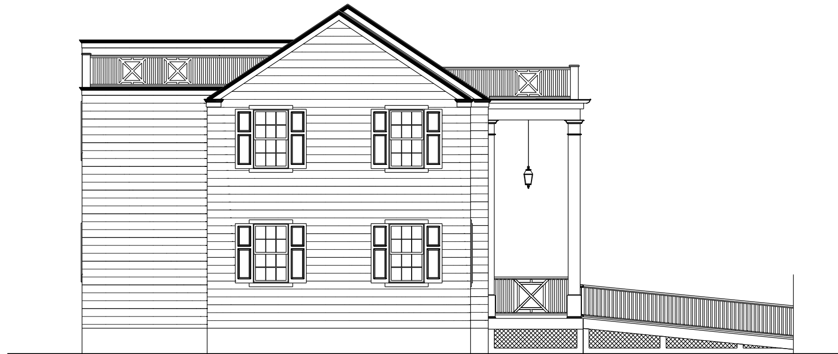
NORTH ELEVATION VILLAGE HALL VILLAGE OF SALTAIRE, N.Y. DRAFT PRINT 1-17-18