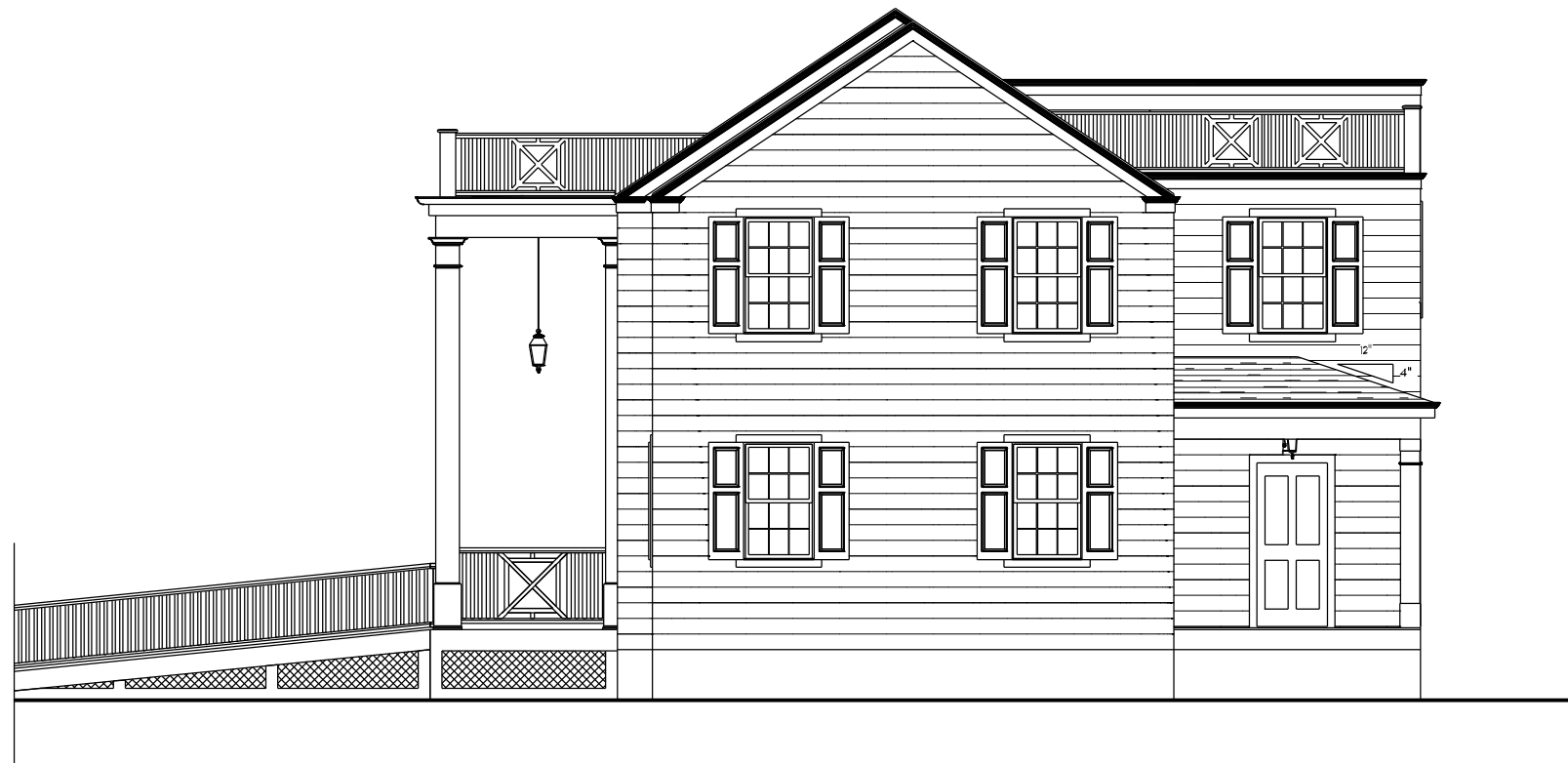
SOUTH ELEVATION VILLAGE HALL VILLAGE OF SALTAIRE, N.Y. DRAFT PRINT 1-17-18