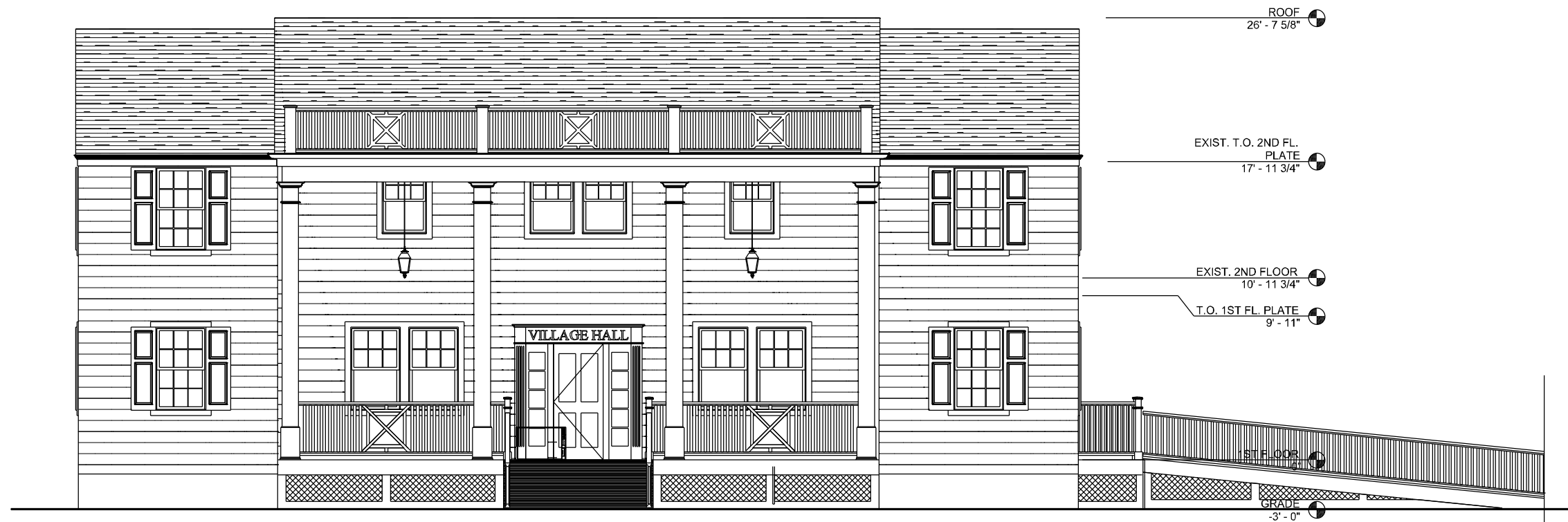
WEST ELEVATION VILLAGE HALL VILLAGE OF SALTAIRE, N.Y. DRAFT PRINT 1-17-18