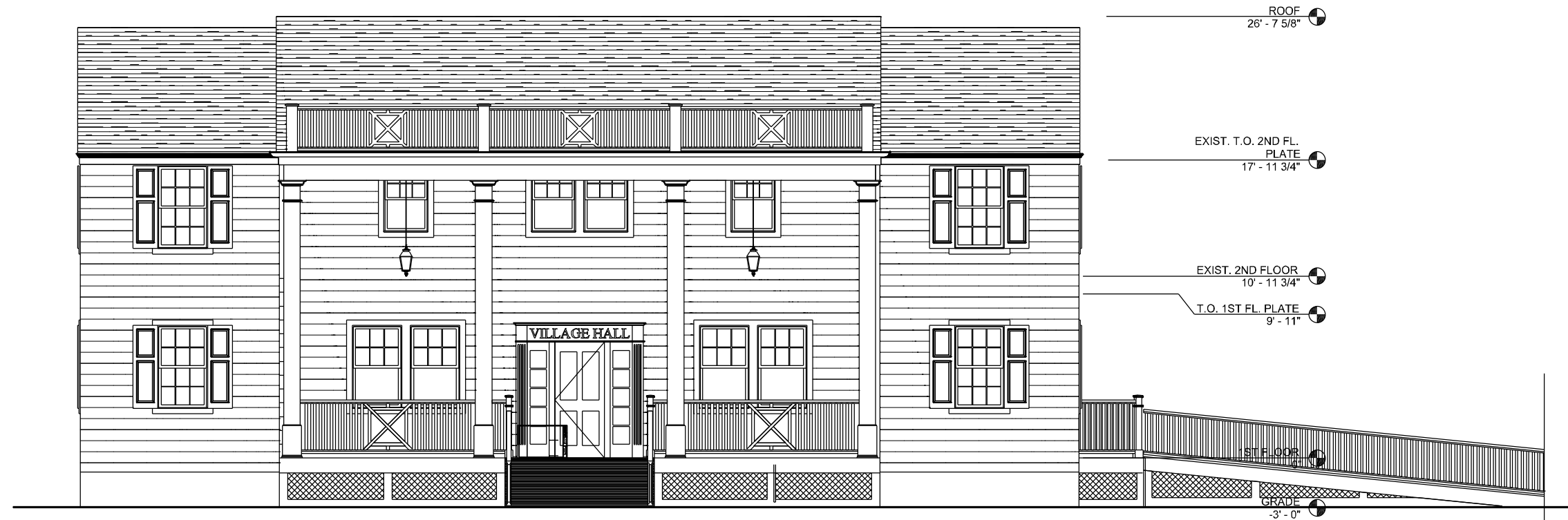
WEST ELEVATION VILLAGE HALL VILLAGE OF SALTAIRE, N.Y. DRAFT PRINT 1-17-18