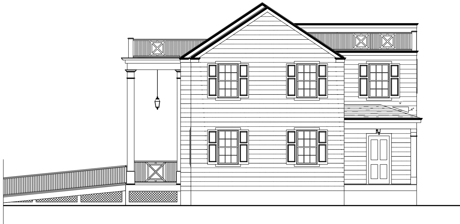
SOUTH ELEVATION VILLAGE HALL VILLAGE OF SALTAIRE, N.Y. DRAFT PRINT 1-17-18